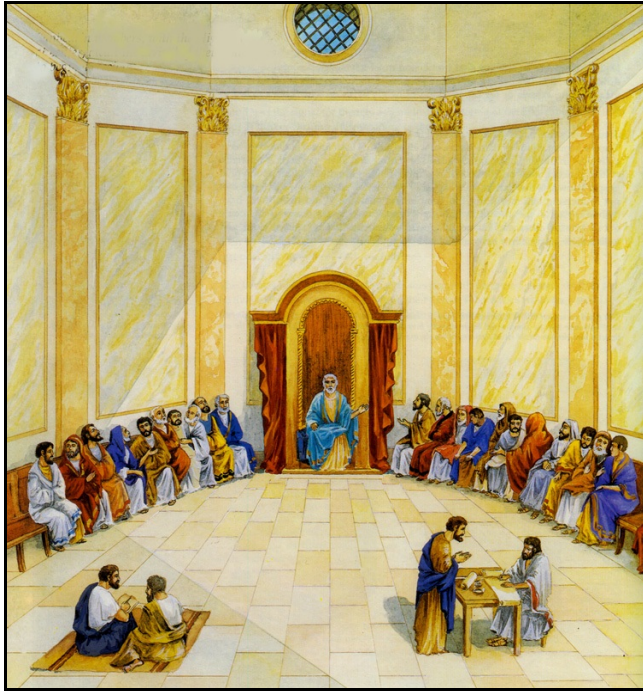
Figure 2. Jewish Sanhedrin in the Holy City of Jerusalem.

It is clear, according to Luke's account, that Paul's journey to Rome from Jerusalem is orchestrated by God and properly begins after Paul's appearance before the Sanhedrin in Jerusalem. The next night after that, Luke tells us that "the Lord stood by [Paul] and said, 'Take courage, for as you have testified to the facts about me in Jerusalem, so you must testify also in Rome'" (23.11).