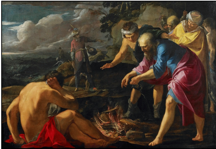
Figure 5. The Viper and Paul on Malta.

Luke compels us to the action here in a dramatic way. He could have said, “The viper bit Paul.” But colorfully he indicates the response of the viper to the heat of the fire and the “angry” and “deliberate” attack of the viper on Paul—it “fastened on his hand.” 68 Luke does this, I feel, to lead us to the shock and amazement of the natives who witness a poisonous viper “hanging from [Paul’s] hand” (verse 4). 69 But from Paul, there is no startled reaction! Luke records no surprise from the apostle, no jerking back, no scream or yell . . . nothing . . . except the tranquil, “He,