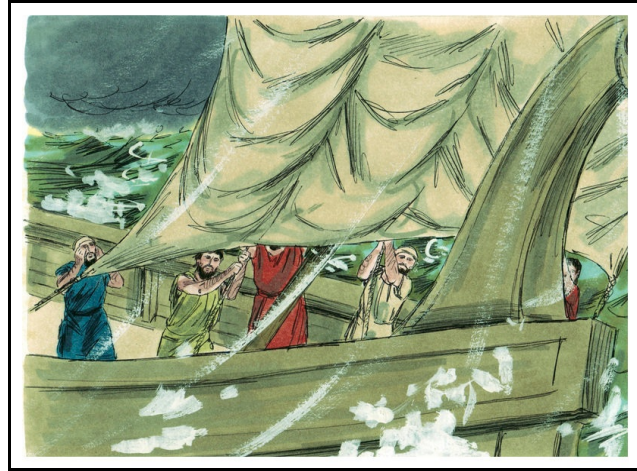
Figure 4. Sailors Struggle With Ship At Sea. “Bible Illustrations by Sweet Media (Online).”

While trying to make the short trek from Fair Havens to the more favorable harbor of Phoenix for the winter, the ship was caught up by a “tempestuous wind, called the northeaster” (verse 14). It was blown off course, completely bypassing southwest Crete, and “driven along” (verses 15, 17) for two weeks “across the